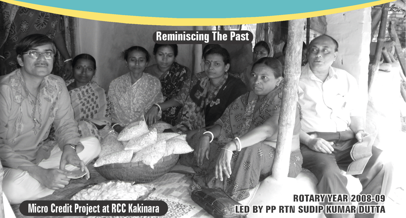
Reminiscing The Past